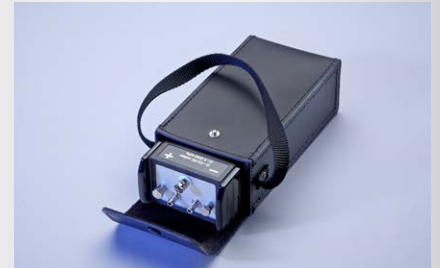
Carrying bag EMA 84 Order no. 9063.0001 (without LCD viewing window) Order no. 9064.0001 (with LCD viewing window)