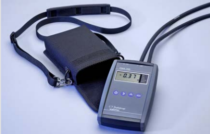
Shoulder bag EMA 200 Order no. 9074.0001