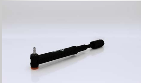
Hand pump KAL 84 Order no. 9601.0036