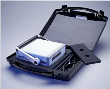
Transport case KAL 100/200 Order no. 9220.0002