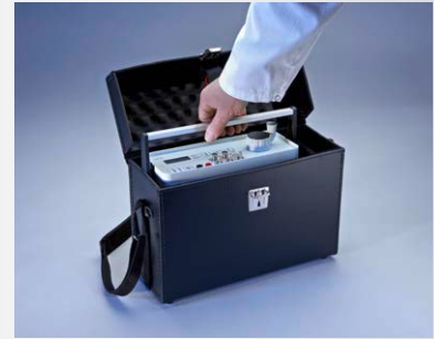
Carrying bag KAL 84 Order no. 9062.0001