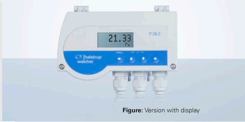
Figure: Version with display